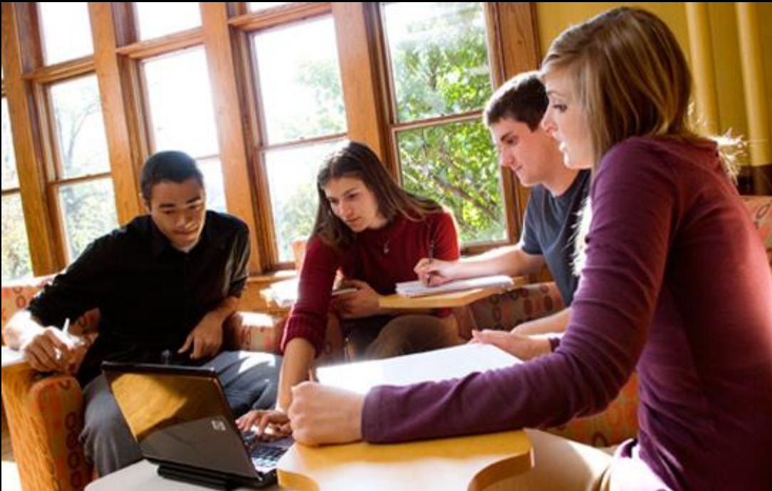
[Untitled photograph of collaborative learning]. (2013). Retrieved April 17, 2015, from: URL ( http://edge.ascd.org/blogpost/5-tips-to-make-your-collaborative-learning-plans-effective )