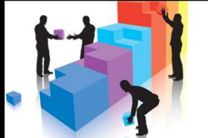
[Untitled clip art of teamwork]. (2014). Retrieved April 17, 2015, from: URL ( http://joelcadwell.blogspot.com/2014/11/building-blocks-compelling-image-for.html )