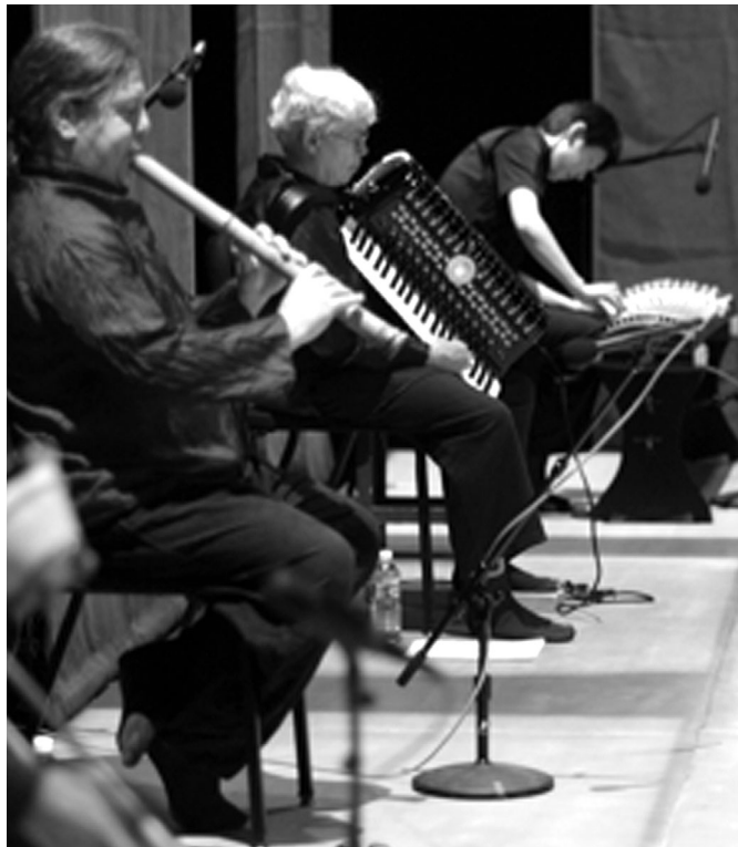
FIGURE 2. The musicians sat along the back of the stage in the area nō musicians would use.

The revaluing of which sounds can be considered music is an attempt to subvert the existing power structures that define and control music. Oliveros writes, "all societies exercise some form of control over music in order to serve their ends. Music which opposes or challenges certain values is often suppressed either consciously or unconsciously by those who have powers of control in societies" (1998: 60). A central mechanism in this structure is the alienation of individuals in the creative process. Oliveros endeavors to disrupt the active cre-