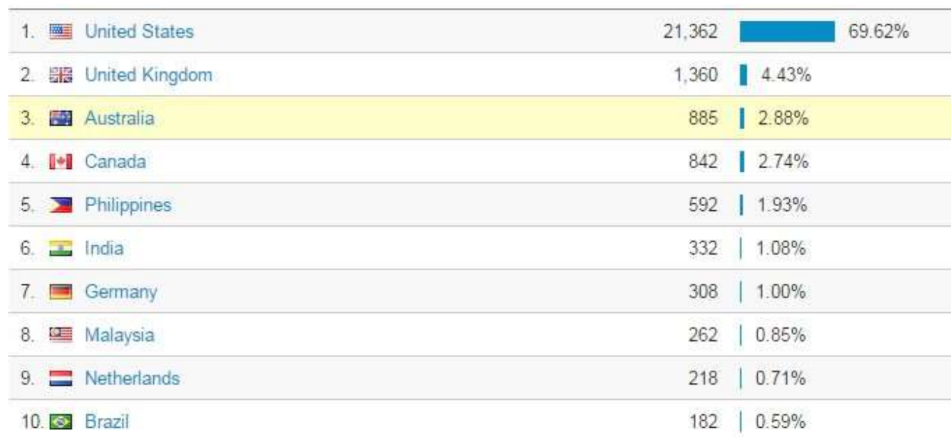
Table 2 Top 10 Countries by Number of Downloads