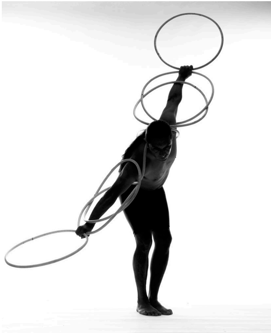
Fig. 1 Dancer Eddie Madril