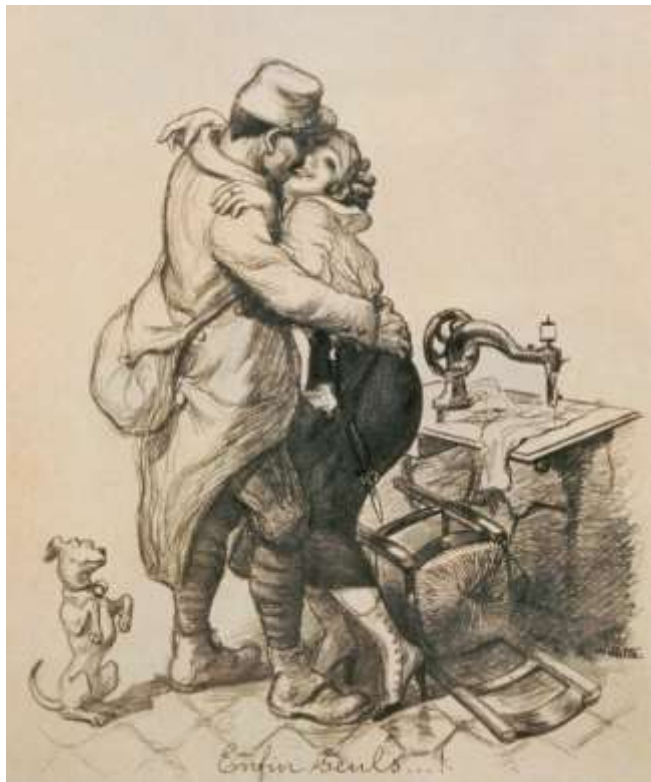
Figure 2. “ Journée du Poilu. ”

The propaganda piece is eerily similar to videos showing soldiers returning home to their pets and families in modern times. Such propaganda creates a sense of potential joy for