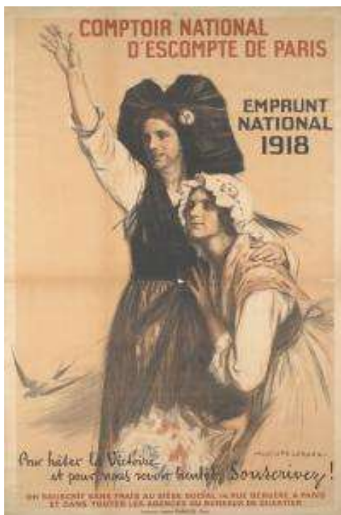
Figure 1. “ Alsace-Lorraine. ”

The two women stand with arms around each other, one with her arm in the air, and both with enthusiastic smiles on their face. As Paddock notes, such propaganda served to remind the French people of their goal in the war which had they had been fighting for over four years – the reacquisition of Alsace-Lorraine (Paddock 199). The French also