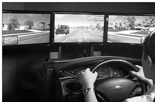
Figure 1. The DriveSafety DS-250r ™ Driving Simulator with three 20-in. panels for a 65° field of view, engineered into the cargo area of a 2010 Dodge Caravan.

Response triggers were programmed into each drive scenario to potentially elicit a reaction from the combat veteran. Nine triggers were programmed into the rural/suburban drive, and 10 triggers were programmed into the city/highway drive. These triggers included trash, disabled