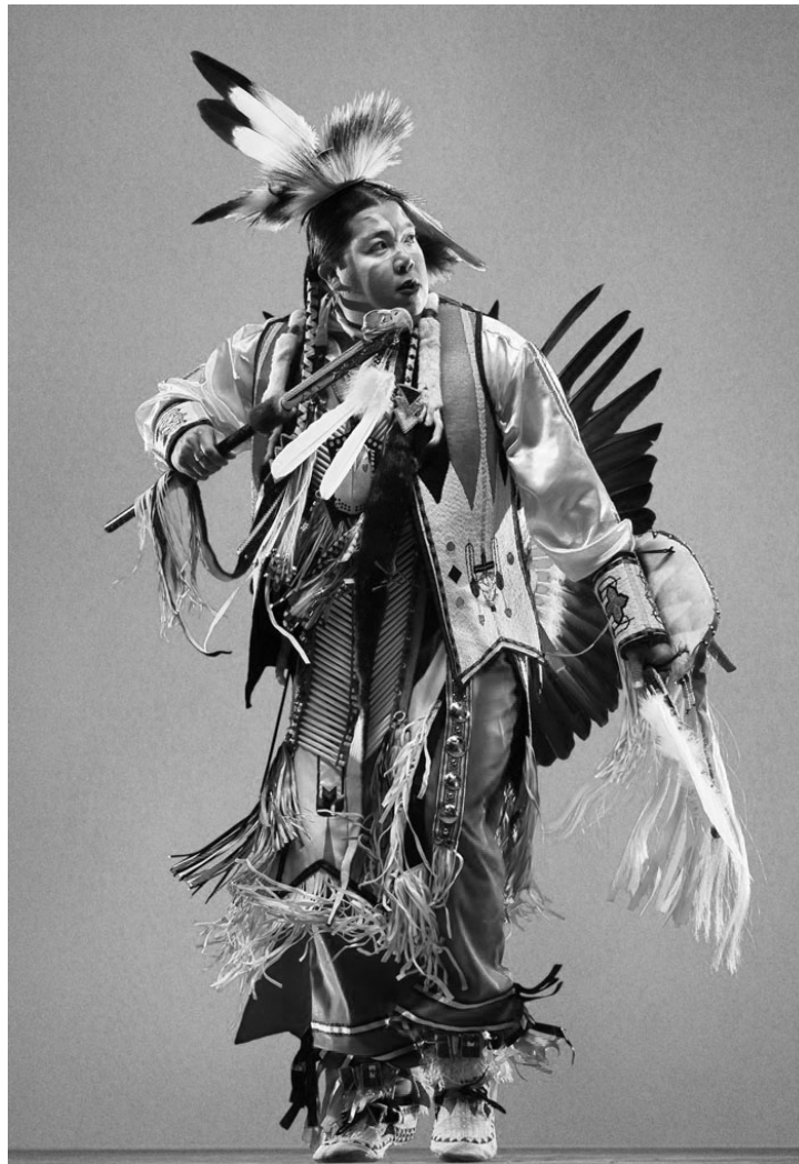
Fig. 3. dancer Marcos Madril