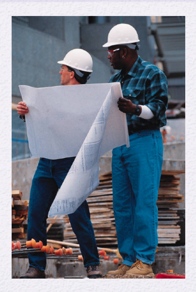
Construction. Retrieved April 17 2015. Clip Art