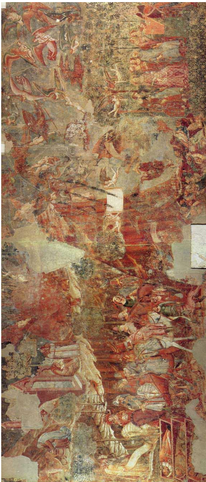
Figure 1. Francesco Traini, Triumph of Death , ca. 1350, Camposanto Monumental, Pisa. Fresco, (5.64 x 15m), Web Gallery of Art, www.wga.hu/index1.html (accessed June 22, 2015).