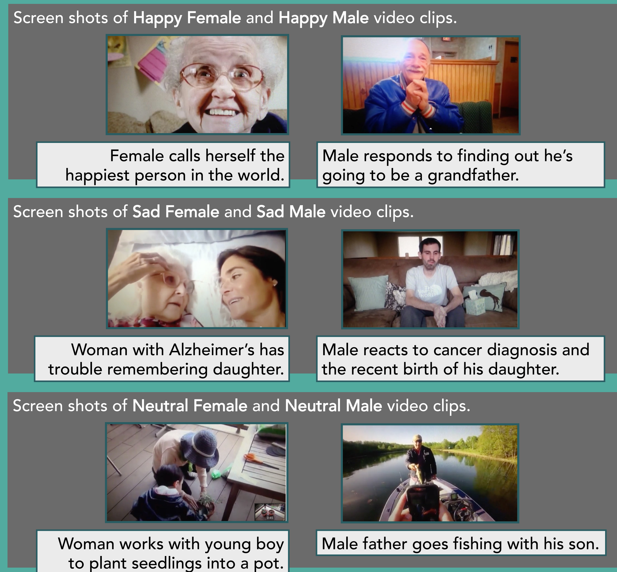
Figure 1. Photo Series of Emotional Conditions