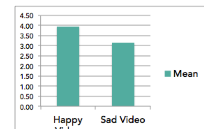
Figure 2. Independent Samples T-Test between Emotional Content in Video and Corresponding Mood State

Positive mood state was compared with viewers of the happy video; Negative mood state was compared with viewers of the sad video.